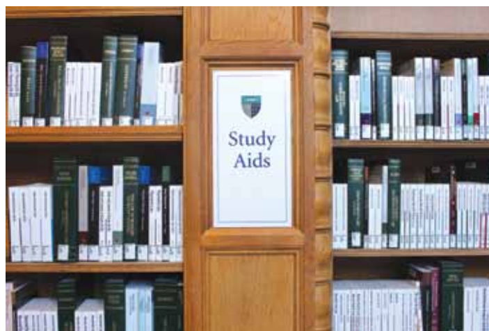
Our collection of Study Aids is located in the Reference Room on L3.

Collection policy reflects the Yale Law School's theoretical orientation, its strong tradition of interdisciplinary studies involving the social sciences and the humanities, and its longstanding interest in law viewed from a global and historical perspective. We favor publications that take a scholarly or critical approach. We favor items published by university presses and other publishers who produce scholarly or authoritative materials. Works that are primarily oriented toward