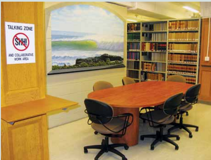
Collaborative work space created on the Lower East Side.

—John Fabian Witt, Acknowledgements in Lincoln’s Code: The Laws of War in American History , 397 (New York: Free Press 2012.)