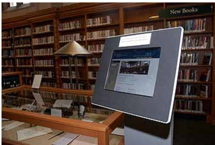
From Legal Pads to iPads exhibit in the L3 Reading Room.

global outreach and it has played a positive role in projecting the law school's identity in countries as diverse as Kazakhstan (14 visits this year), Iceland (18 visits), India (796 visits), and Iran (79 visits).