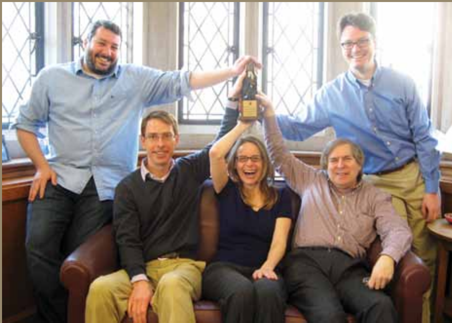
Yale Law Library Public Interest Auction Trivia Team defeated YLS Student Team for the second consecutive year.