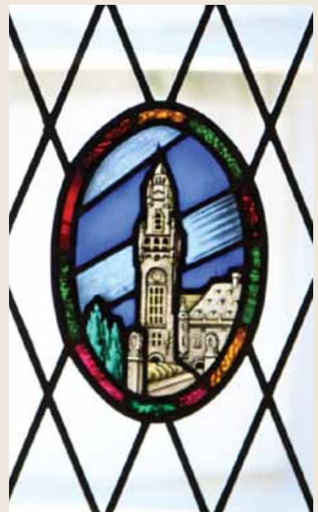
Peace Palace Library at the International Court of Justice, The Hague.