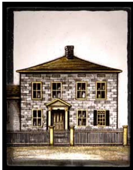
Litchfield Law School