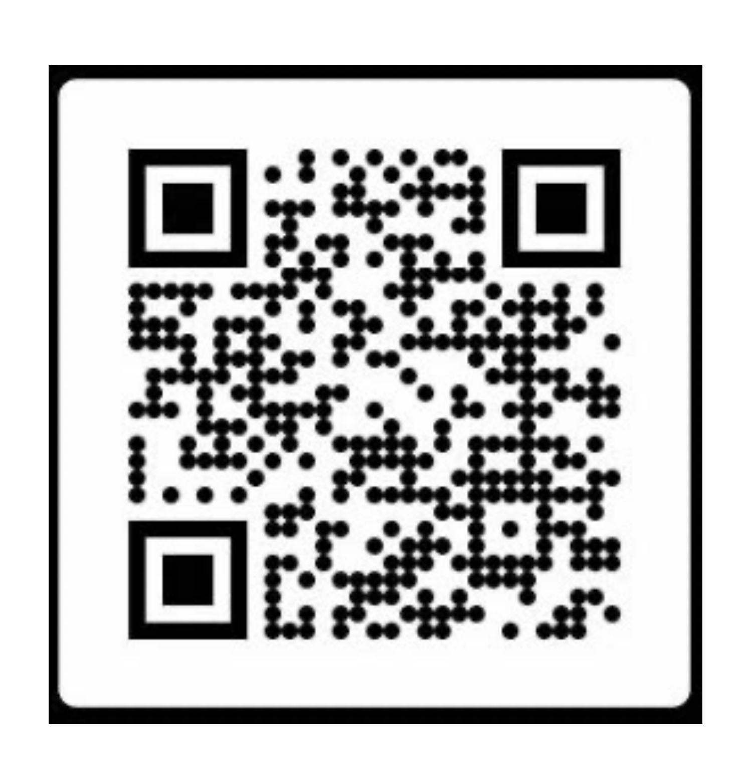
Scan the QR Code to view The Visiting Room Project's archive of videos

The Visiting Room Project is a digital experience that invites the public to sit face-to-face with people serving life without the possibility of parole to hear them tell their stories, in their own words. More than five years in the making, the site is the only collection of its kind, containing over 100 filmed interviews with people currently serving life without parole. The interviews were filmed at Angola, the Louisiana State Penitentiary, which is, in many ways, the epicenter of life without parole sentences worldwide.